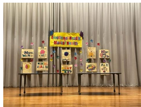
"Teen Mental Health Summit" at Eastside High School 5/13/23