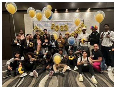
Planned Parenthood Teen Conference: "Empowering Healthy Minds" 5/11/23