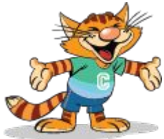
Riletta Twyne Cream Early Childhood Center