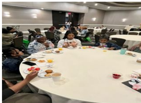
Mother/Daughter Retreat "Our Truth, Our Triumphs." 5/6/23