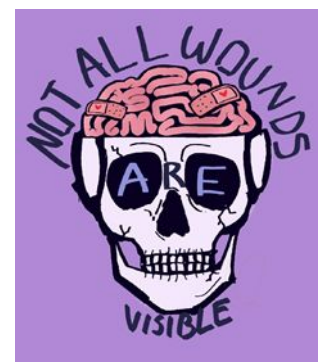
"Not All Wounds Are Visible." Artwork 5/20/23