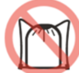
Solid color cinch bag