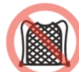
Mesh or straw bag