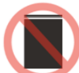
Colored plastic storage bag