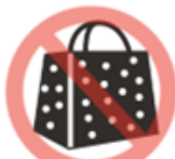
Printed patterned plastic bag