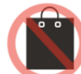
Large tote bag