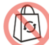
Reusable grocery tote