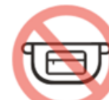
Large fanny pack